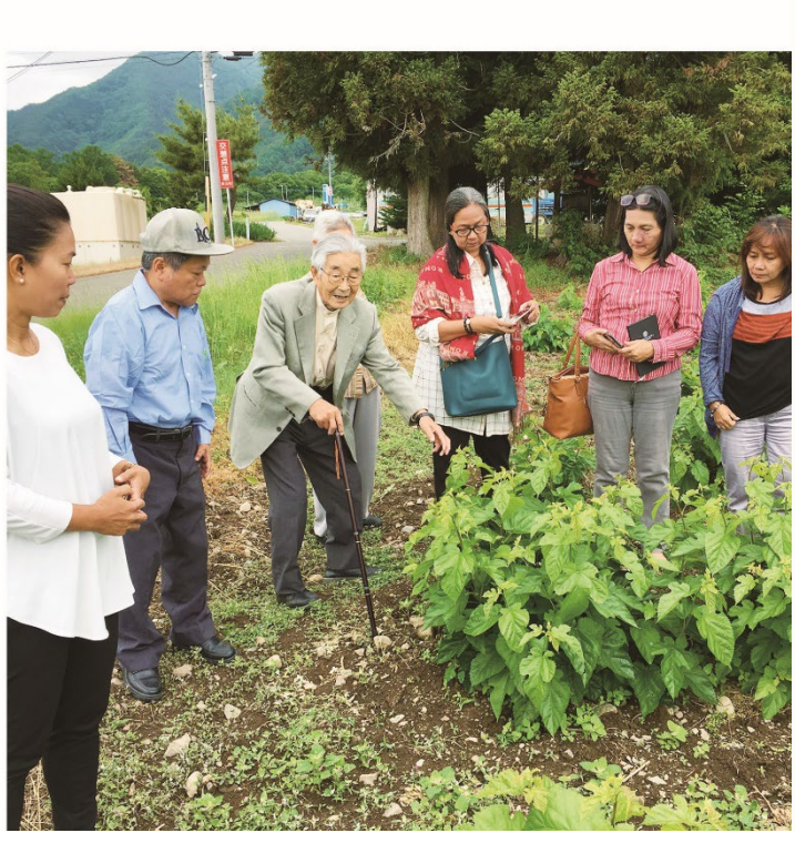
Sericulture technical training in Japan for Philipino (Nagano, Japan)

Tree Planting: 10 countries, 300 ha (April, 2019- March, 2020)