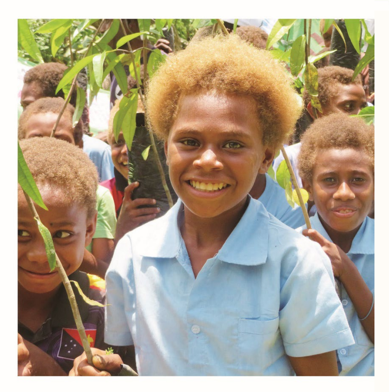
Total 5,264 schools in 36 countries