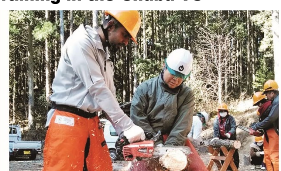
In addition to the agricultural training, trainees participate youth seminars and field works