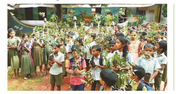
Children are collecting seeds of indigenous plant, India