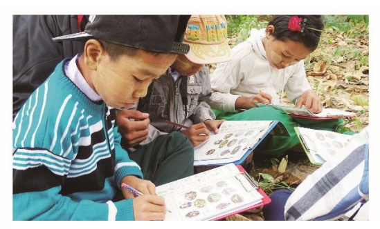
Environmental Education: Eco seminar at their forest, Myanmar