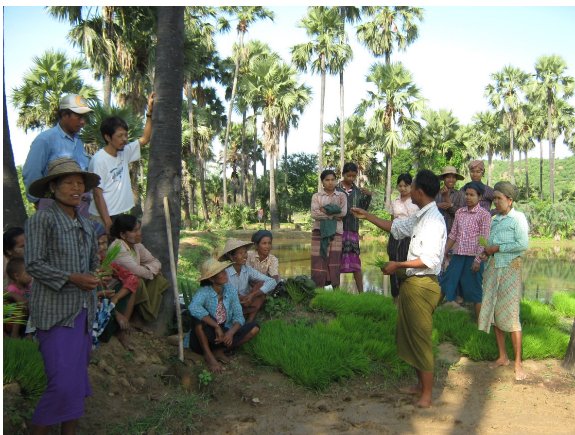
OISCA center staff advising villagers on simple, but improved rice culture method.