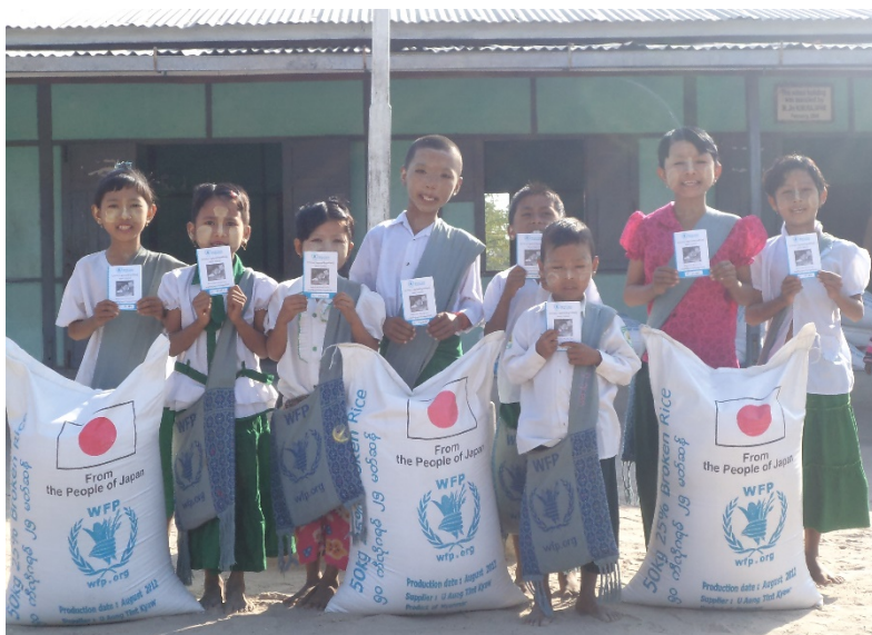
Parents work guarantees basic livelihood to children – rice.

OISCA-International Izumi 2-17-5, Suginami-ku Tokyo, 168-0063 Japan http://www.oisca.org/ E-mail: oisca@oisca.org