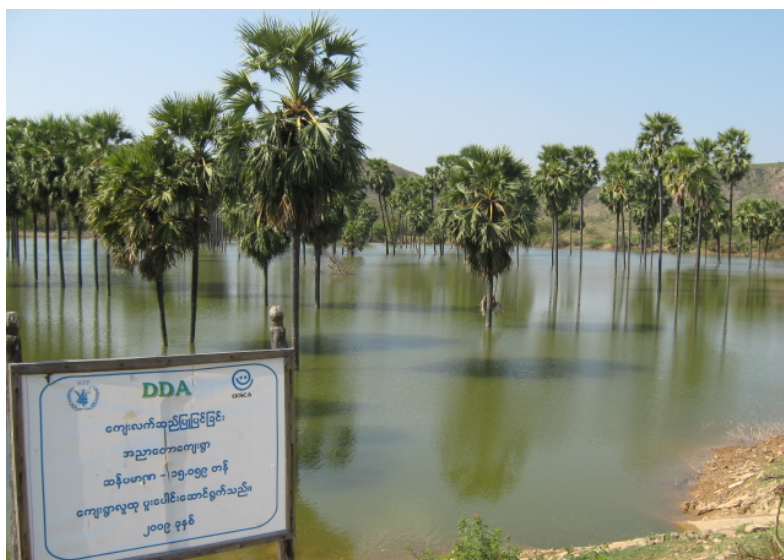
Renovated reservoir with full of water serving for dual purposes, irrigation and drinking water.

OISCA-WFP projects have been exclusively taken care by DOA-OISCA Agriculture and Rural Development Training Center because of its location.