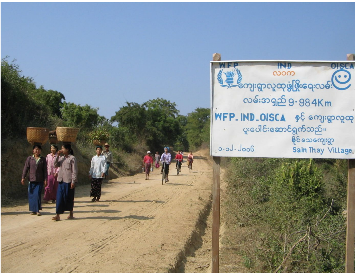
People walking through renovated community road.