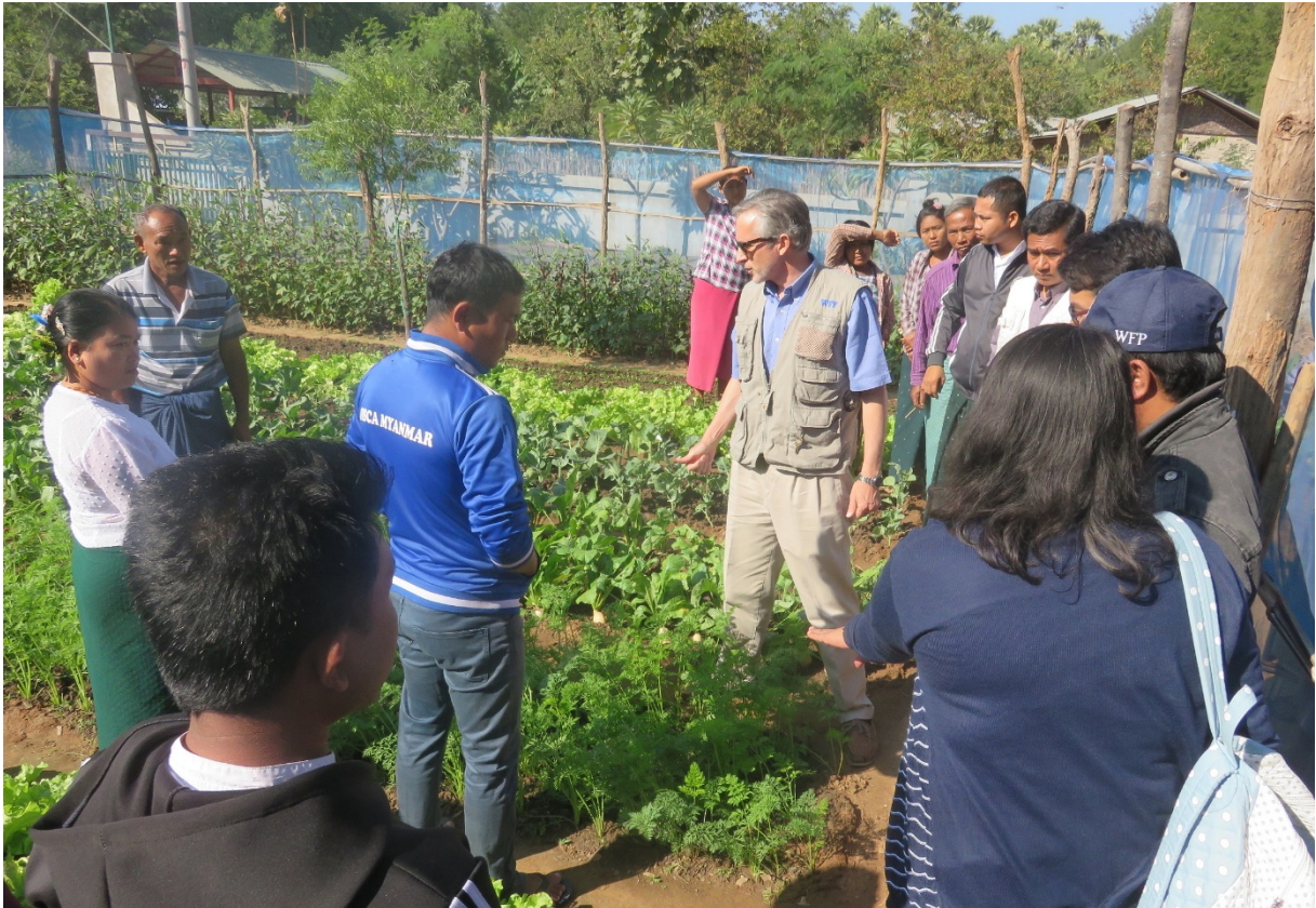
WFP Myanmar country director visits WFP-OISCA vegetable garden.