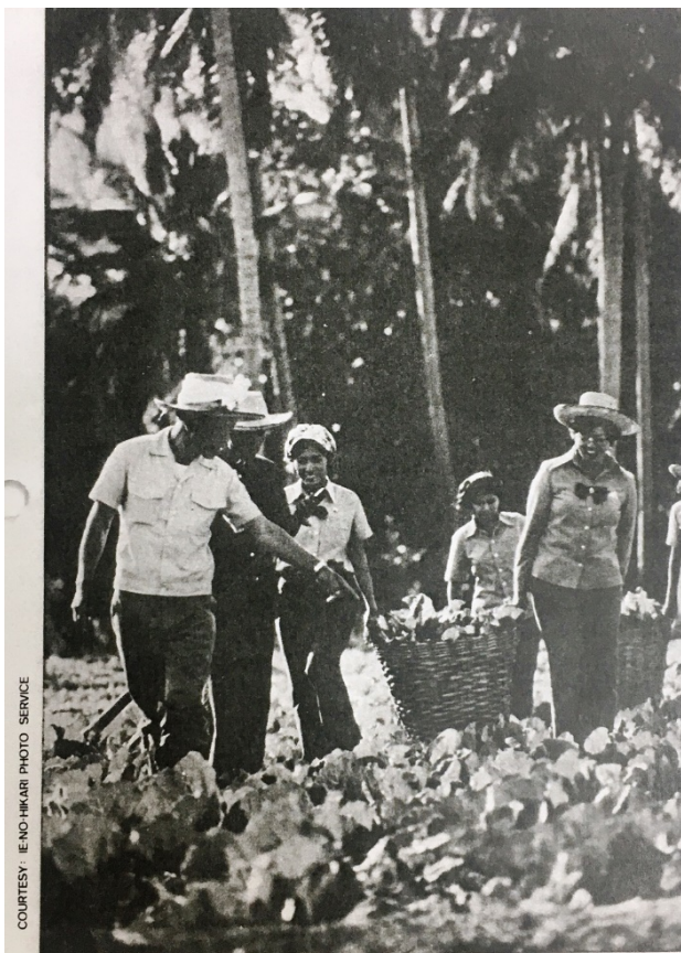
Photo left was taken in 1980. Guided by OISCA-assigned Japanese expert (extreme left), local farmers, and GGAT staff have harvested well mature vegetables and carry them with full of smile. The farm hosted the field work by the First Youth Forum participants in 1976 (page 5). It has been making a steady improvement. The farm was visited on July 23 rd 1977 by Prime Minister Thanin who made the opening speech at the First Youth Forum on December 5 th 1976.