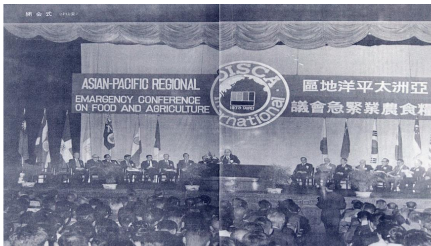
Asian-Pacific Regional Emergency Conference on Food and Agriculture in Taipei, November 1973.