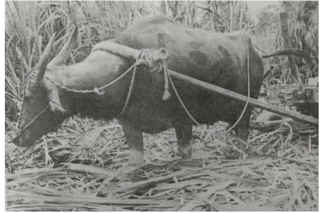
A scene of sugarcane plantation in central region of Taiwan. Buffalos were an important work force in 1973.

In November 1973, Asian Pacific Emergency Conference on Food and Agriculture took place in Taipei, organized by OISCA-International with the cooperation of Taiwan's agriculture authority and OISCA ROC Chapter. A report indicates that about 1,500 participants assembled from many countries in the region. The importance of organic farming and the skill training on organic farming to young farmers was confirmed at the Conference. In fact, OISCA has been implementing practical skill training on organic farming to young resourceful nation builders of developing countries ever since its foundation in 1961 (ref: Bulletin Board No.143).