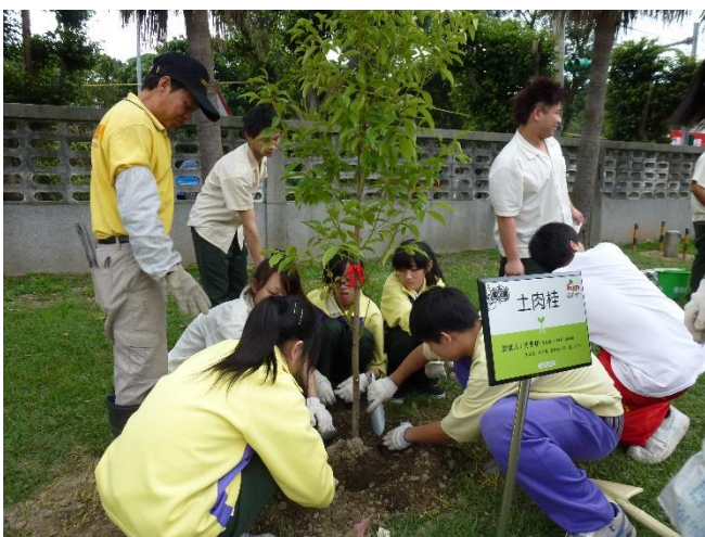
School children of Taiwan, too, are active in planting trees. Their contribution is highly appreciated by their parents, community residents and by local and national governments.

OISCA ROC Chapter immediately joined LOVE GREEN campaign when OISCA-International launched it in 1980. The island of 35,961 km 2 has been implementing it every year ever since its inception, including the Children’s Forest Program. Japanese volunteers very often join their Taiwan counterparts to plant trees of friendship, too.