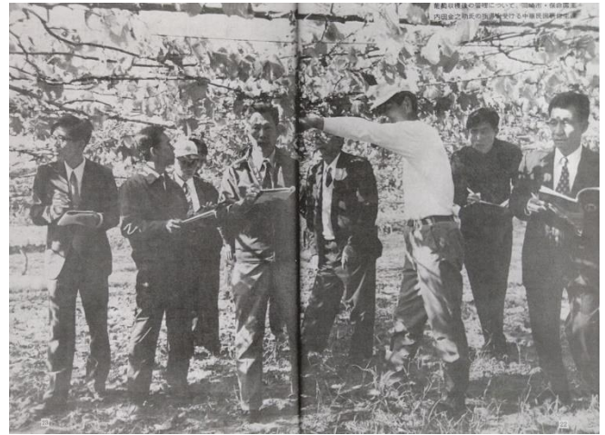
Taiwanese farmers attentively listen the grape growers' explanation at Okazaki, central Japan, in October 1974.

Because of the existence of national counterparts in Taiwan, OISCA-International was able to organize 2 nd Asia Youth Forum for Community Development in April 1977 and 13 th Asian-Pacific Youth Forum for Community Development in May 1995 (ref: Bulletin Board No.142). Participating youth leaders and workers from many countries in the region were able to witness, in addition to advancing friendship among themselves, the steady progress in agriculture and industry that this small island territory had been making.